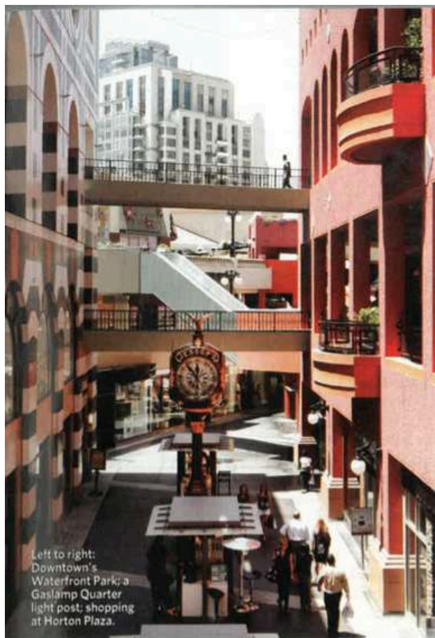
Left to right: Downtown's Waterfront Park; a Gaslamp Quarter light post; shopping at Horton Plaza.

Museum (404 Third Ave.) features a garden and koi pond.