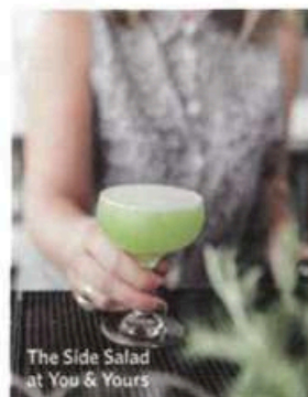
The Side Salad at You & Yours

Shop and dine at The Headquarters at Seaport , offering boutiques and galleries; and Seaport Village , with shops, restaurants and galleries such as Wyland Galleries (855 W. Harbor Drive), selling paintings, prints and sculptures by marine life artist Wyland. Grab an iced cappuccino at Upstart Crow Bookstore & Coffeehouse (835-C W. Harbor Drive) and head for the Embarcadero Marina Park , which offers bike and jogging trails, basketball courts and picnicking. Continue north along the harbor to Broadway Pier and embark on sightseeing cruises and/or dinner excursions aboard the Hornblower (970 N. Harbor Drive), or catch the Coronado Ferry (1050 N. Harbor Drive). Make time to tour the retired USS Midway aircraft carrier and the floating Maritime Museum . ☉